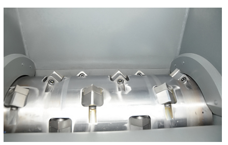
All ZERMA shredders are equipped with our E-style flat rotor. The knives are fixed in special knife holders fitted in machined pockets.