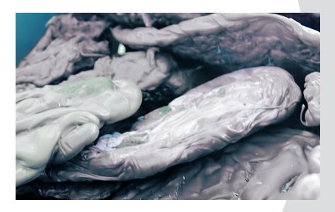
The ZBS shredders feature an aggressive tangential infeed for easy feeding without the need for a hydraulic system. Lumps of up to 400 mm diameter can be processed easily in this machine series.